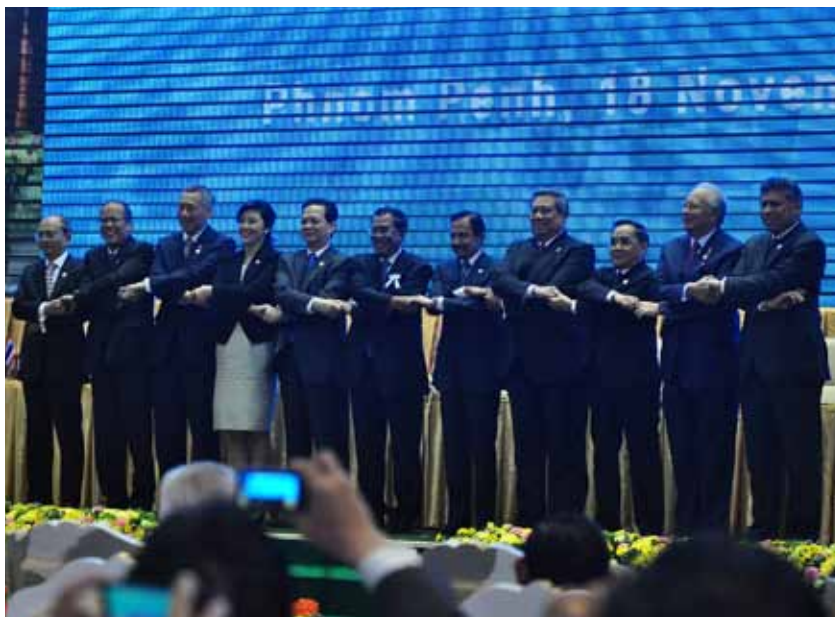
Opening ceremony of the 21st ASEAN Summit, Phnom Penh, Cambodia

ties and better air connectivity within the region.