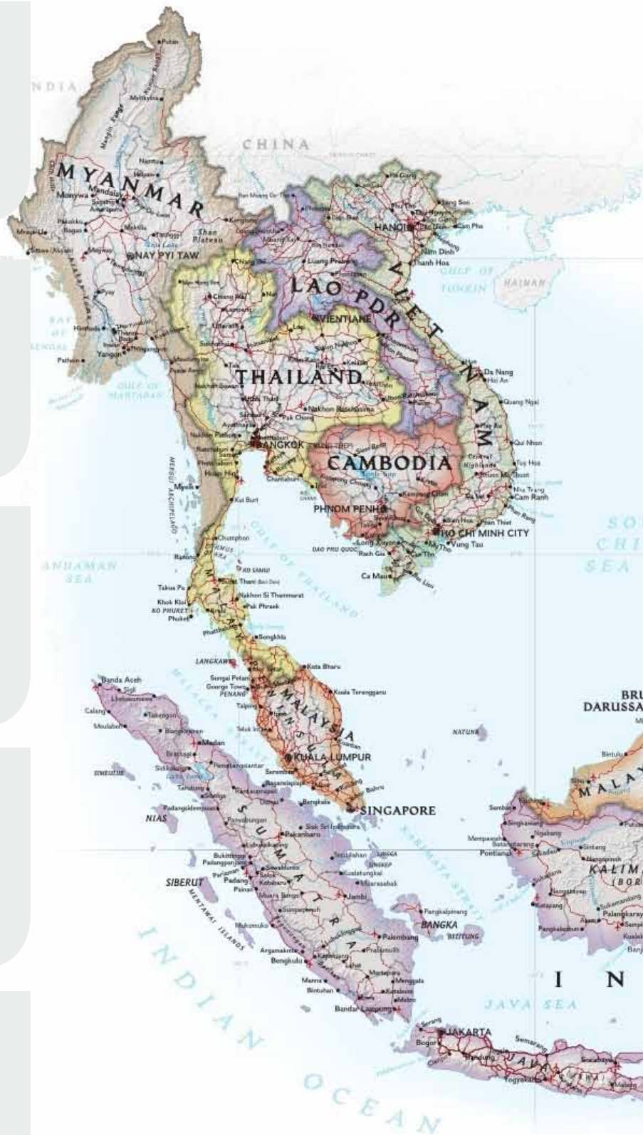
National Geographic Indonesia for ASEAN Tourism Map

Population (2011 estimate): 87.8m Capital city: Hanoi (6.5m) GDP growth (2012): 9.0% Inflation (2012): 9.2% Main industries: Rice, coffee, rubber, cotton