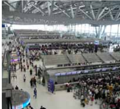
Suvarnabhumi Airport, also known as Bangkok International Airport

Of the 15 prioritised projects outlined in the Master Plan on ASEAN Connectivity (MPAC), one is focused on boosting tourism in the region. It deals with easing visa requirements for ASEAN nationals in order to facilitate mobility of people and tourists and possibly involve visa exemptions for intra-ASEAN travel by ASEAN nationals in all member states.