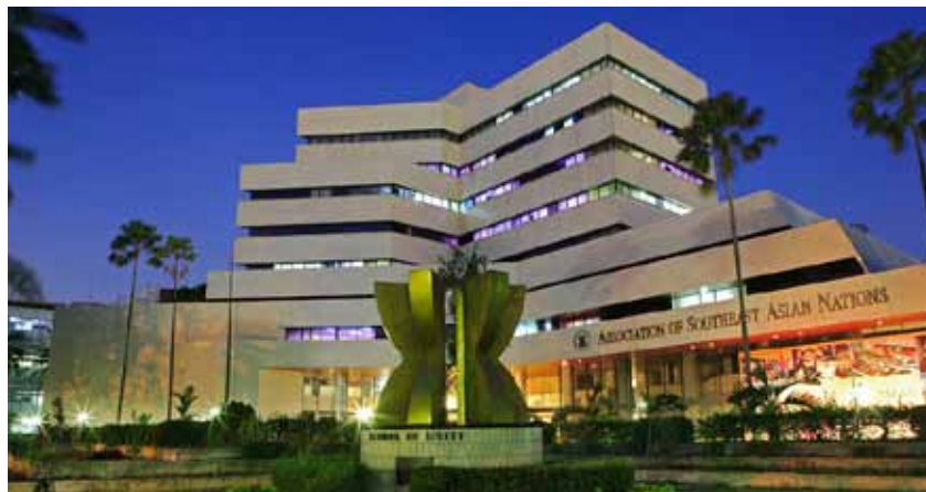
ASEAN headquarters in Jakarta, Indonesia

To take a brief step back, one of the purposes of the ASEAN Charter, which was agreed at the 13th ASEAN Summit in November 2007, was to create a single market and production base. It was recognised that better connectivity of transportation networks would help create a more competitive and resilient ASEAN – bringing people, goods, services and capital closer together. The Master Plan was