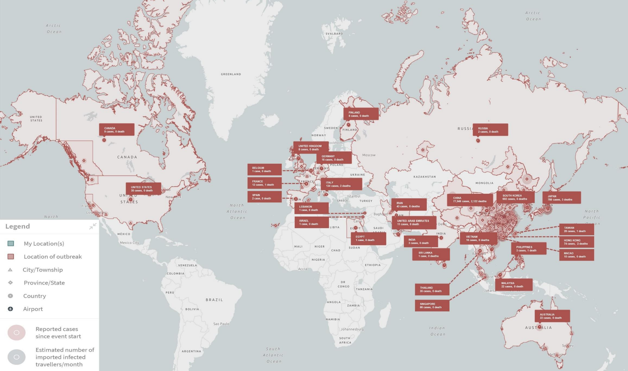
Figure 1. Global map of countries with COVID-19 confirmed cases as of February 24, 2020 (2 PM GMT+8)