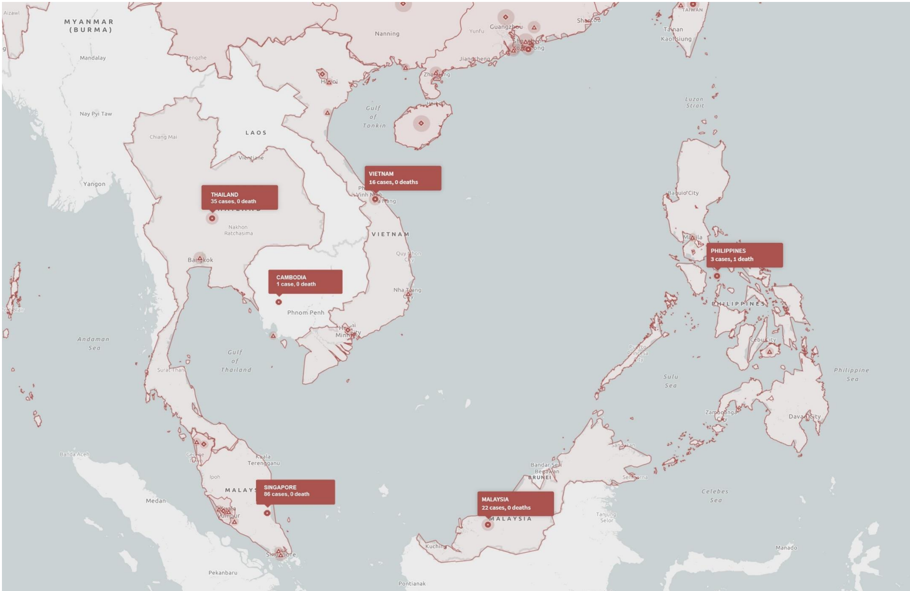
Figure 2. ASEAN Region with COVID-19 confirmed cases as of February 24, 2020 (2 PM GMT+8)