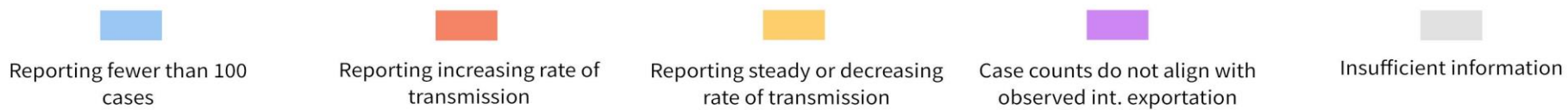
Figure 1. Countries worldwide and its category based on level of COVID-19 transmission, supported by data generated by Bluedot's global epidemic surveillance system