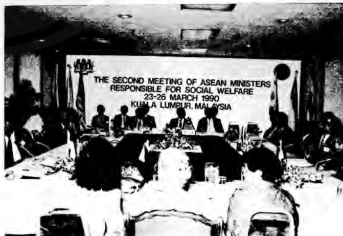
THE SECOND MEETING OF ASEAN MINISTERS RESPONSIBLE FOR SOCIAL WELFARE 26 - 26 MARCH 1990 KUALA LUMPUR, MALAYSIA

8 It also agreed that the Promotion of Self Employment and Development in the Informal Sector (PIACT) project be submitted to the 5th Cycle of UNDP; the ASEAN Labour Information Network (ALINE) be strengthened and for the development of a format for TCDC training fellowship programme.