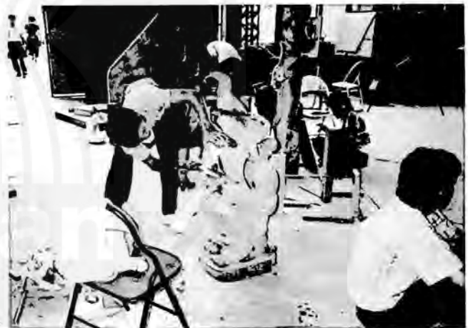
Participants to the ASEAN Youth Sculpture Workshop and Exhibition during the Workshop session

14 With the establishment of the ASEAN-Republic of Korea Sectoral Dialogue on 2 November 1989, it was anticipated that in the latter half of 1990 the ASEAN Secretariat would be requested to act as the trustee of a special account in Jakarta for the implementation of projects approved under the framework of the ASEAN-Republic of Korea Sectoral Dialogue.