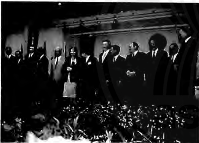
The Foreign Ministers of ASEAN and the Dialogue Partners at the end of the Post Ministerial Conferences, Bandar Seri Begawan, 8 July 1989.

27 During the 8th AEMM, the ASEAN Ministers expressed their appreciation for the important contribution by the EC in the field of development cooperation and hoped that this cooperation would be expanded both in scope and depth in regional projects open to all its member states.