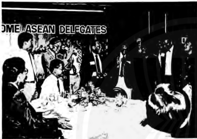
Farewell Dinner of the ASEAN Architecture Symposium

31 Human Resources Development (HRD) is a major element for the future development of ASEAN. Management training institutions play a vital role in enhancing HRD through the organization of regional management training and research programmes, exchange in production of teaching materials, research on training methods and processes and exchange of experts.