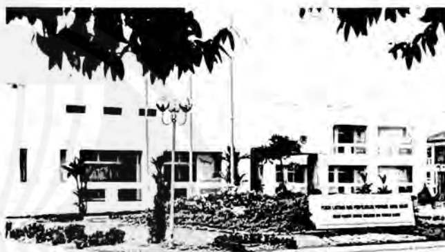
The Building of ASEAN Poultry Disease Research and Training Centre (APDRTC), VRI, Ipoh, Malaysia

"Upgrading of National Poultry Disease Diagnostic Laboratories in ASEAN Countries".