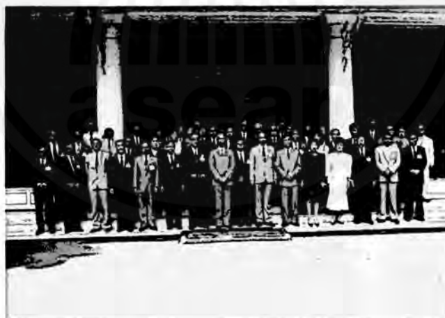
Vice-President of the Republic of Indonesia and delegates to the Fifth ASEAN conference on Civil Service Matters posed at the Indonesian State Palace, Jakarta, 4 September 1989.

3 The Fifth ASEAN Conference on Civil Service Matters was held in Jakarta and Bali from 4 to 9 September 1989. The theme of the conference was "Human Resource Development and its impacts on the Improvement of Public Services in ASEAN". The Meeting deliberated on civil service system relating to performance appraisal report and new policies for the improvement of the system, merit system, personnel information system, promotion system and job analysis as well as education and training.