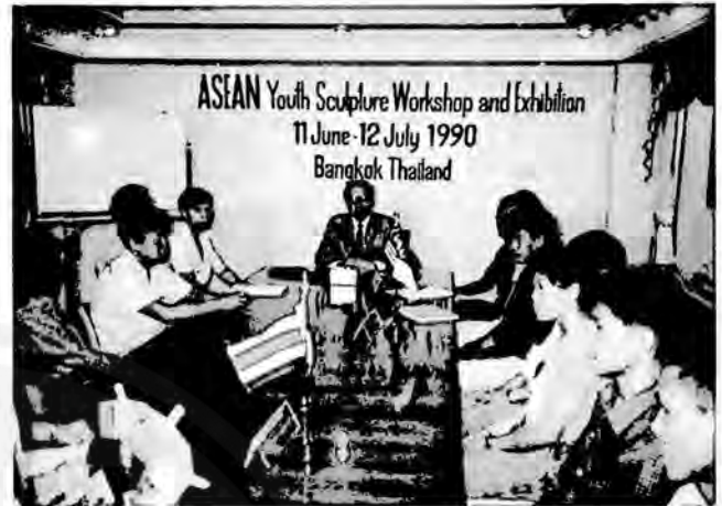
Welcoming Ceremony of the ASEAN Youth Sculpture Workshop and Exhibition, Bangkok, Thailand, 11 June - 12 July 1990.