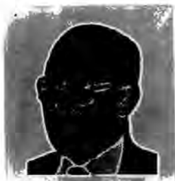
H.E. MR. ALI ALATAS Foreign Minister of the Republic of Indonesia