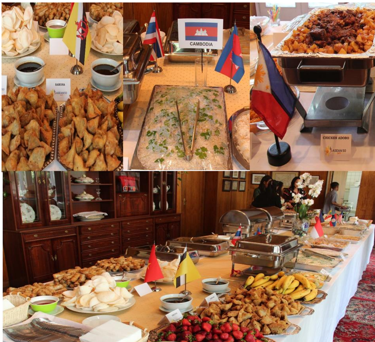
A buffet of signature Southeast Asian dishes prepared by the ASEAN Moscow Committee for the guests of the ASEAN Day reception held at the Embassy of the Philippines on 8 August 2017.

To showcase ASEAN’s cultural diversity and add color to the occasion, traditional dishes from the ten ASEAN member countries and folk dances from the Philippines and Indonesia were featured at the reception.