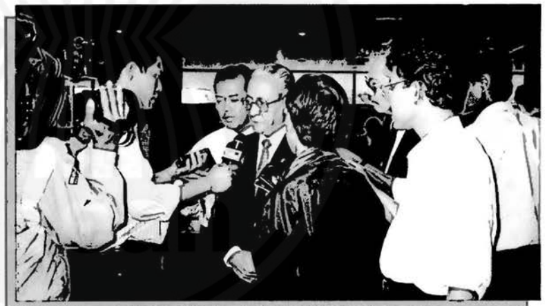
Minister Ali Alatas talks to the press after the transfer of office