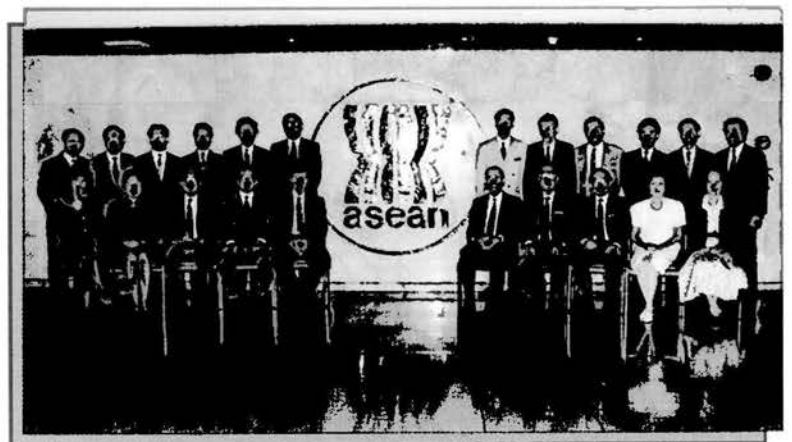
The Secretary-General of ASEAN and the ASEAN Secretariat professional staff.