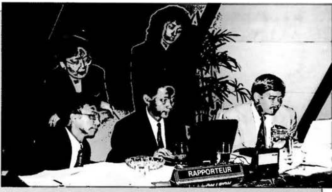
ASEAN Secretariat staff at the rapporteur desk

The ASC Meetings held during the year addressed important issues for consideration of the 26th ASEAN Ministerial Meeting. Efforts were directed towards implementing the decisions of the Fourth Summit in various fields of cooperation.