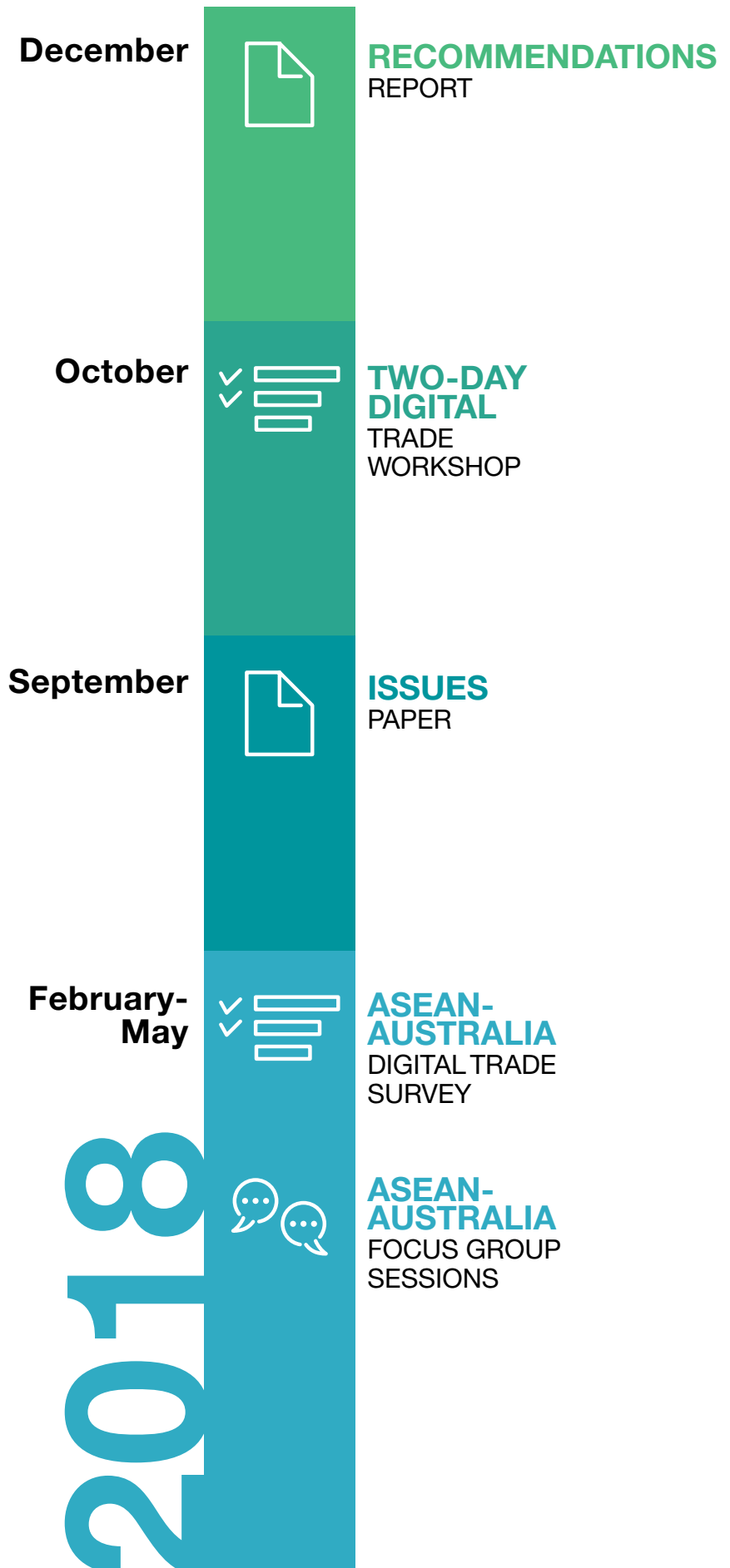
Figure 2: ASEAN-Australia Digital Trade Standards Cooperation Initiative Structure

The initiative was developed through a collaboration between the ASEAN Consultative Committee on Standards and Quality (ACCSQ), the ASEAN Coordinating Committee on e-Commerce (ACCEC), the Australian Government's Department of Foreign Affairs and Trade (DFAT), Department of Industry, Innovation and Science (DIIS), and Standards Australia. Standards Australia has provided leadership of the Initiative, with coordination and oversight from the ASEAN Secretariat. The Initiative has been structured and delivered according to the activities and timeline shown in Figure 2.