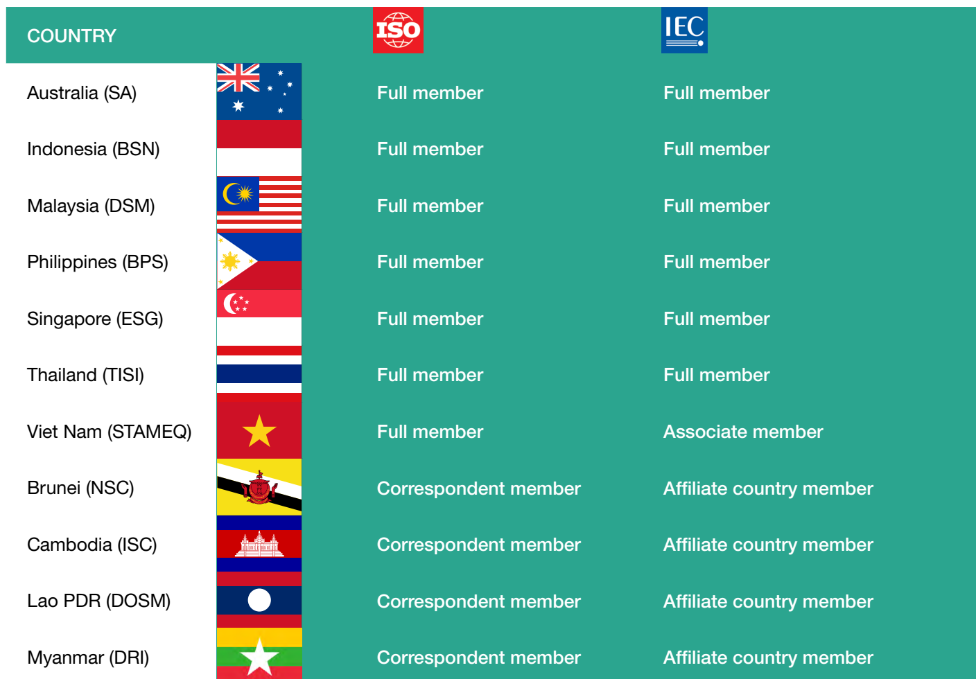
Figure 1: ASEAN and Australian membership of ISO and IEC

The International Organization for Standardization (ISO) and the International Electrotechnical Commission (IEC) are the two leading non-government bodies responsible for the development of International Standards. The two bodies develop market-based reliable