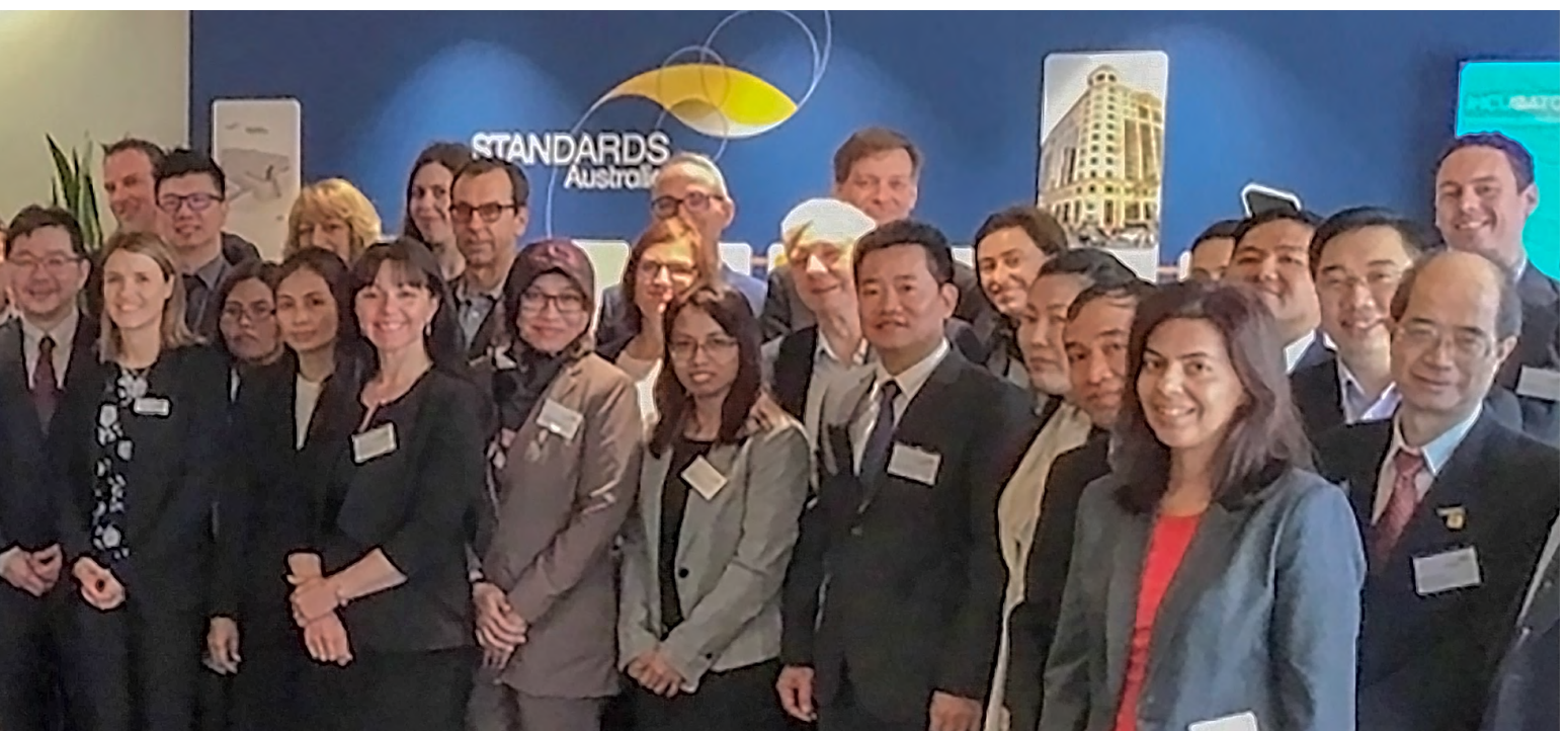
Figure 4: Participants at the ASEAN-Australia Digital Trade Workshop in Sydney, October 2018

The Governments of ASEAN and Australia will determine how best to take forward the recommendations in order to create greater awareness of, engagement in, adoption and use of International Standards for supporting digital trade in the future.