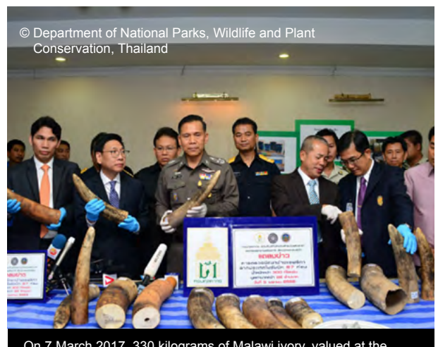
On 7 March 2017, 330 kilograms of Malawi ivory, valued at the equivalent of approximately US$547,500, trafficked by a Gambian national, were seized at Suvarnabhumi Airport.