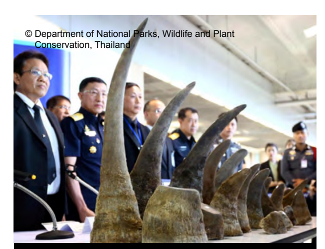
On 10 March 2017, 21 unusually large rhino horns from Ethiopia, valued at the equivalent of approximately US$5.5 million baht were seized from the baggage of woman at Suvarnabhumi Airport.