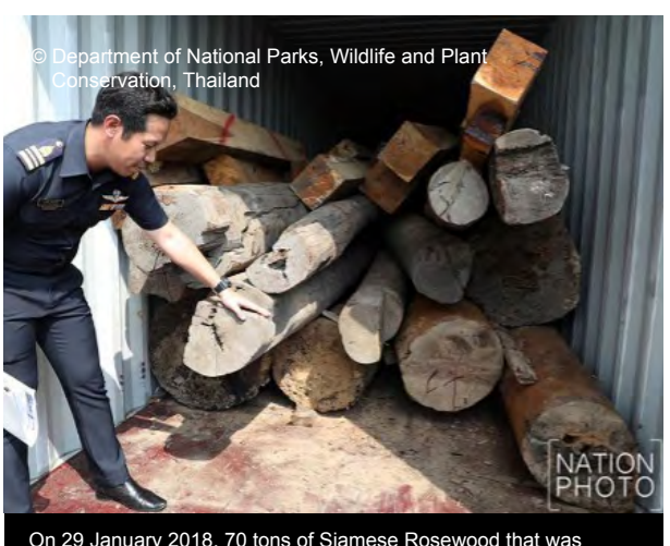
On 29 January 2018, 70 tons of Siamese Rosewood that was hidden in four containers ready for distribution to Hong Kong were seized at Bangkok port.