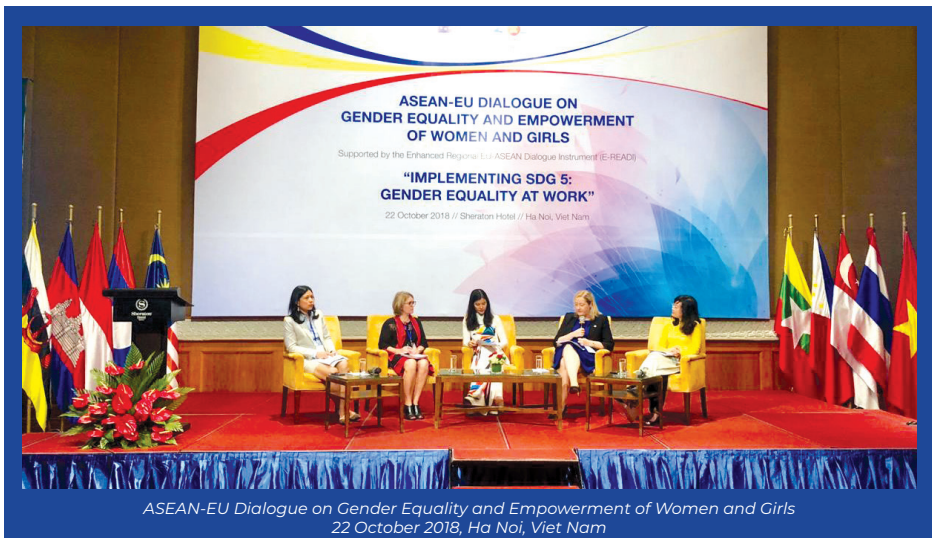
ASEAN-EU Dialogue on Gender Equality and Empowerment of Women and Girls 22 October 2018, Ha Noi, Viet Nam