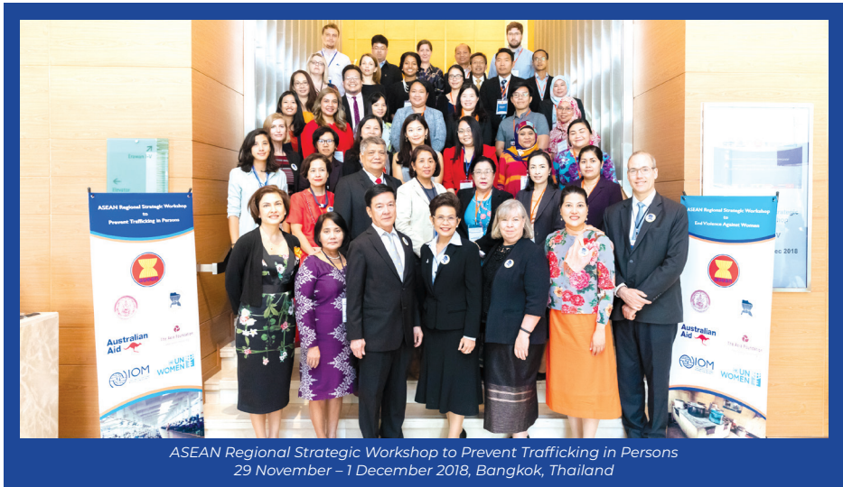
ASEAN Regional Strategic Workshop to Prevent Trafficking in Persons 29 November – 1 December 2018, Bangkok, Thailand