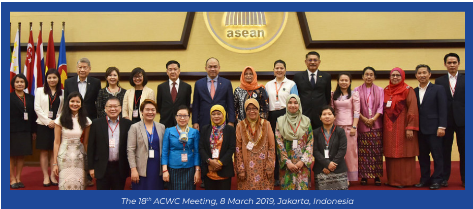
The 18 th ACWC Meeting, 8 March 2019, Jakarta, Indonesia